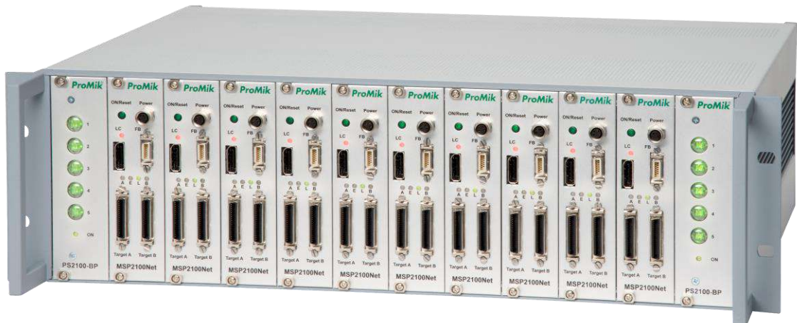
MSP2100NET 19" Rack Version